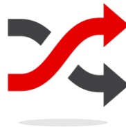
Meeting demands for flexible working