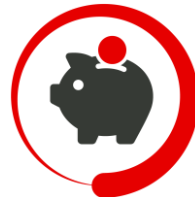
Controlling cost of a mobile workforce