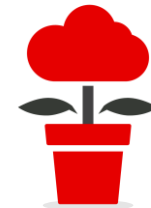
Growth in cloud-based technology