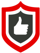
Providing reliable, secure and effective connectivity